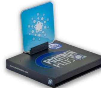
POZITRON PLUS LARGE (protective radius 20 meters)