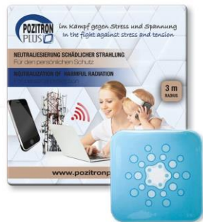
POZITRON PLUS FOR PERSONAL USE (protective radius 3 metres)