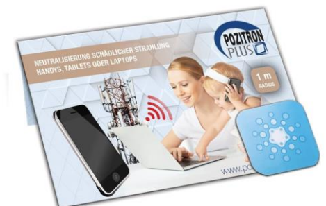
POZITRON PLUS MOBILE PHONE (protective radius 1 meter)